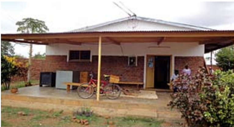
Jim's bike at the Herbal Clinic

Finally, after spending a thousand in one month, I bought a bicycle. It cost $100 and I had one of the carpenter shops make a wooden box and mount it on the back. The box was big enough for most of the things I carried and if something was too big, I tied it on top of the